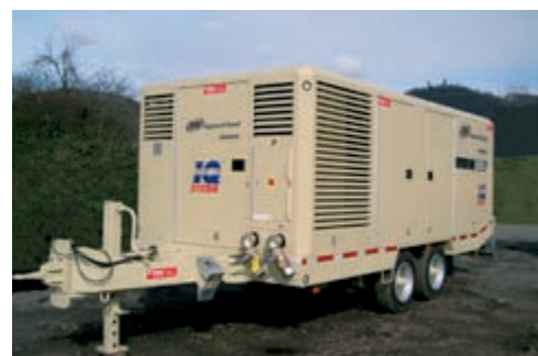
25/330 on optional high speed tandem axle and equipped with optional IQ system.